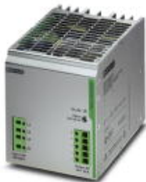
Primary-switched TRIO POWER power supply for DIN rail mounting, input: 3-phase, output: 24 V DC/20 A

Please be informed that the data shown in this PDF Document is generated from our Online Catalog. Please find the complete data in the user's documentation. Our General Terms of Use for Downloads are valid ( http://phoenixcontact.com/download )